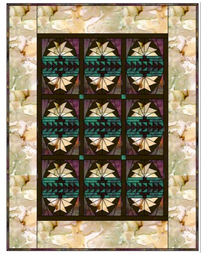
20.5 x 26.5 inch wall hanging

ORDER FOR SEWING PIECES TOGETHER Sew A, B, E and F together. (twice) Add corners D and C. (twice) Sew G to one ABCDEF piece. Add the last ABCDEF piece to the ABCDEFG